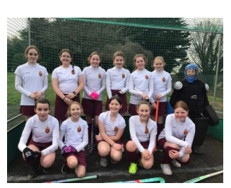
Yr 8 B Team

We have had another successful term in the Girls' PE Department. The U13A and U14A hockey teams finished their season with strong wins over Kilkeel High School, winning 4-0 and 2-1.