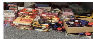
Delighted to gather goods for the Emmanuel Christmas hamper appeal.

Many thanks to all pupils and their families for their continued generosity of spirit. We have no doubt that it makes a huge impact on the lives of so