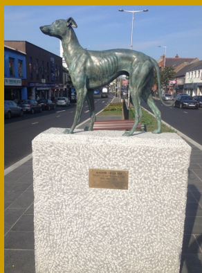
The bronze statue of Master McGrath located in Lurgan town centre

A bronze statue of Master McGrath Cont'd on p.2