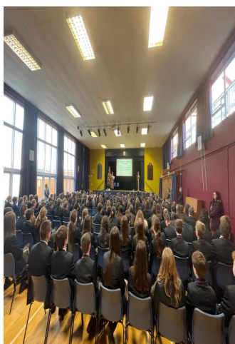
Rewards assembly Year 9

We were delighted to organize our termly Rewards Assemblies for Years 8, 9 and 10 to celebrate the children's achievements across the curriculum. These took place in the newly decorated Junior Assembly Hall which is now a great formal place to carry out such an important event. It was a joy to see so many of our pupils being rewarded for their efforts.