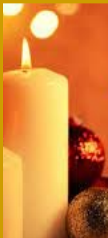
'Carols by Candle-light'

Tickets available for our 'Carols by Candle-light' service - Monday 19th December at 7pm. Please go to Eventbrite.com to get your FREE ticket.